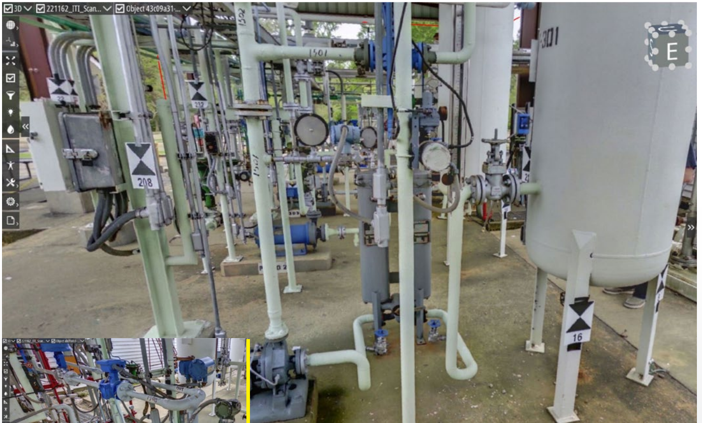
High quality Laser-Scan in UniversalPlantViewer